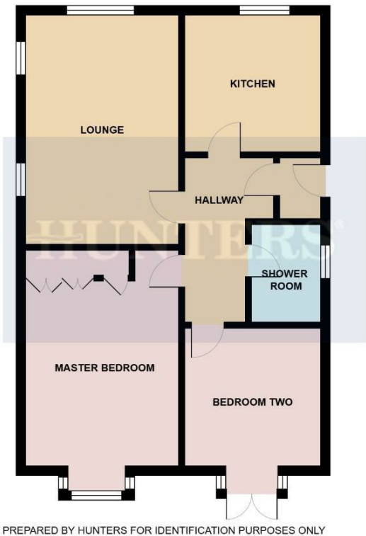
PREPARED BY HUNTERS FOR IDENTIFICATION PURPOSES ONLY

Please contact our Hunters Gainsborough Office on 01427 616118 if you wish to arrange a viewing appointment for this property or require further information.